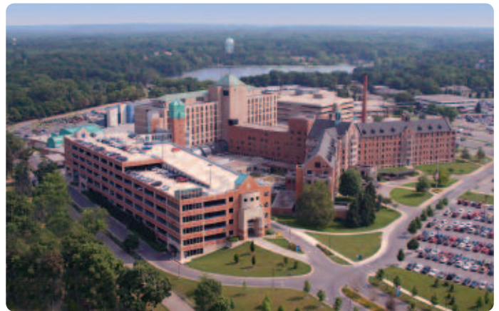
Borgess Medical Center

Additional information about Borgess Health and our PGY-1 residency program can be found at pharmacyresidency.borgess.com .