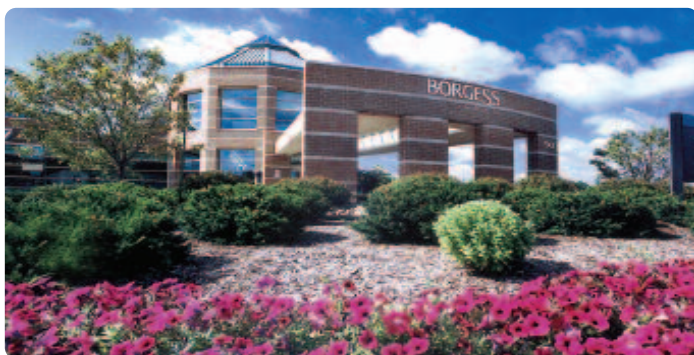
Borgess at Woodbridge Hills

Borgess Ambulatory Care is comprised of multiple clinics, including family practice, internal medicine, pediatrics, women's health, behavioral health, heart failure, diabetes, and geriatrics. Borgess at Woodbridge Hills in Portage, Michigan is Borgess' largest ambulatory care setting.